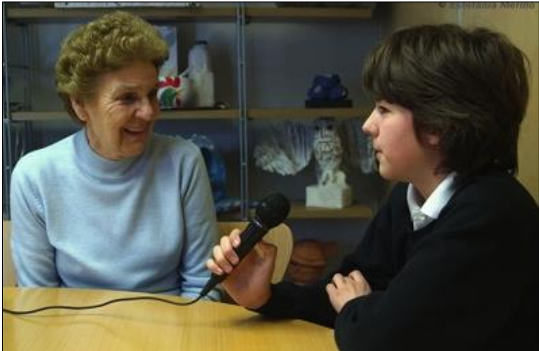
Students at Stoke Newington School conducting oral history interviews.